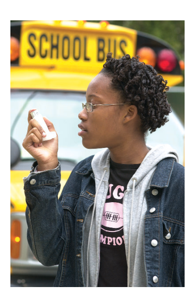
Children and adults with asthma who are active outdoors are most vulnerable to the health effects of sulfur dioxide.

Long-term exposure to sulfur dioxide can cause respiratory illness, alter the lung's defense mechanisms, and aggravate existing cardiovascular disease. People with cardiovascular disease or chronic lung disease, as well as children and older adults, may be most susceptible to these effects.