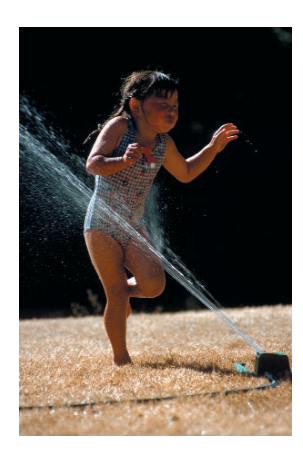
The risk of exposure to unhealthy levels of ground-level ozone is greatest during summer months.

■ Bad Ozone. In the Earth's lower atmosphere, near ground level, ozone is formed when pollutants emitted by cars, power plants, industrial boilers, refineries, chemical plants, and other sources react chemically in the presence of sunlight. Ozone at ground level is a harmful air pollutant.