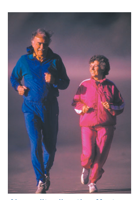
Air quality directly affects our quality of life.

The AQI is an index for reporting daily air quality. It tells you how clean or polluted your air is, and what associated health effects might be a concern for you. The AQI focuses on health effects you may experience within a few hours or days after breathing polluted air. EPA calculates the AQI for five major air pollutants regulated by the Clean Air Act: groundlevel ozone, particle pollution (also known as particulate matter), carbon monoxide,