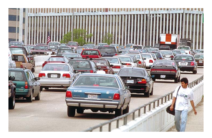
Vehicle exhaust contributes roughly 60 percent of all carbon monoxide emissions nationwide.