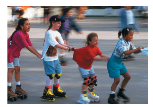
Children active outdoors can be sensitive to some air pollutants.

In large cities (more than 350,000 people), state and local agencies are required to report the AQI to the public daily. When the AQI is above 100, agencies must also report which groups, such as children or people with asthma or heart disease, may be sensitive to the specific pollutant. If two or more pollutants have AQI values above 100 on a given day, agencies must report all the groups that are sensitive to those pollutants. Many smaller communities also report the AQI as a public health service.